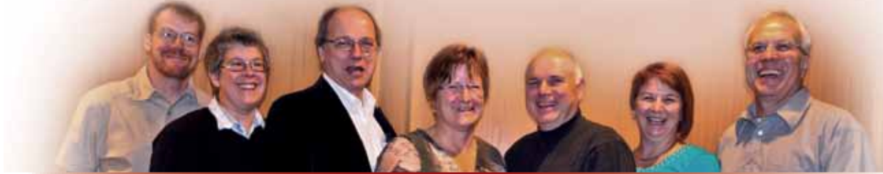
The CAAT-A bargaining team