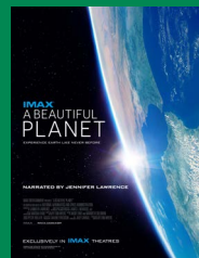
A Beautiful Planet