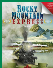
Rocky Mountain Express

Visit OntarioScienceCentre.ca/IMAX for show times!