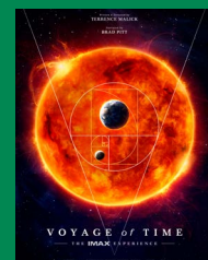
Voyage of Time