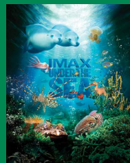
Under the Sea