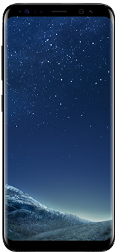
Samsung Galaxy S8